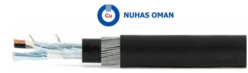
TABLE 9 Instrumentation Cable - IOSCR Armoured