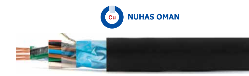
TABLE 5 Instrumentation cables Unarmoured Type - 1